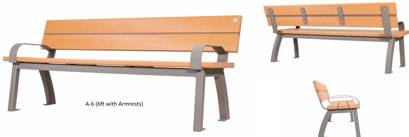
A-6 (6ft with Armrests)

ANA-6 (6 ft without armrests) ANA-5 (5 ft without armrests) A-6 (6 ft with armrests) A-5 (5 ft with armrests)